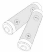
Battery (2 Pieces)